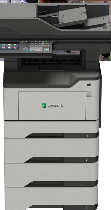
MX522adhe with optional trays